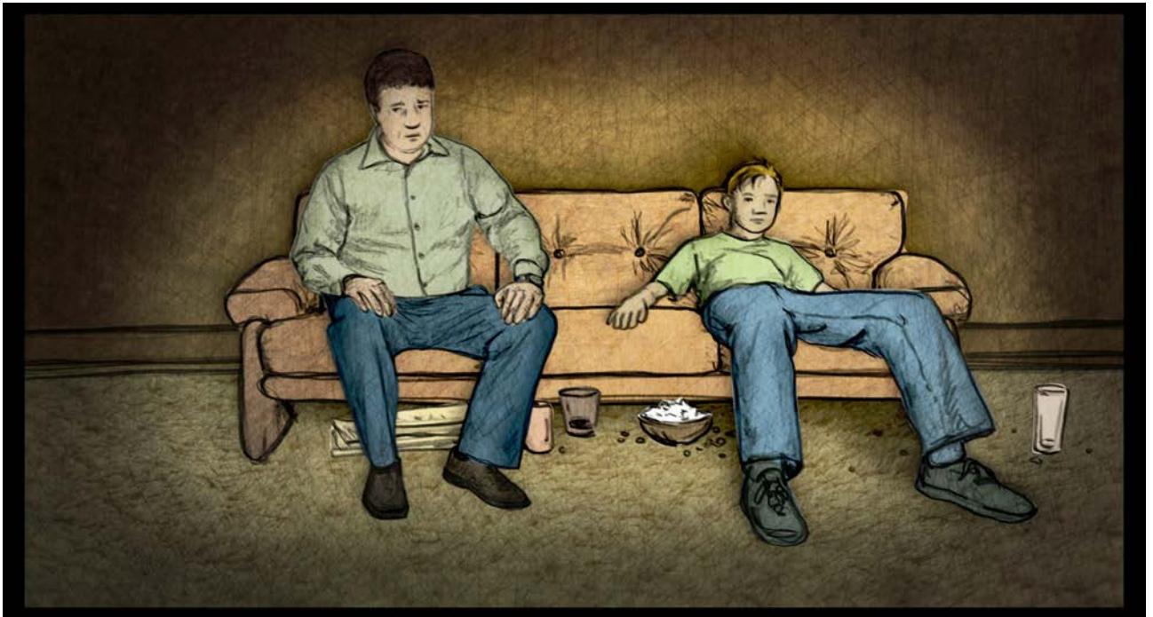
Still image from : “THE TALK” TRUE STORIES ABOUT THE BIRDS & THE BEES