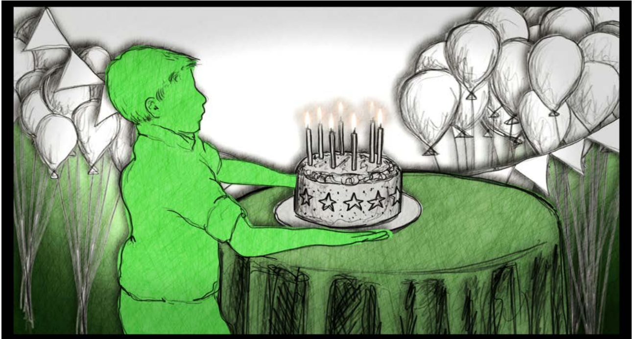
Still image from : “THE TALK” TRUE STORIES ABOUT THE BIRDS & THE BEES