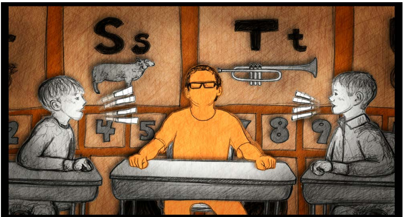
Still image from : “THE TALK” TRUE STORIES ABOUT THE BIRDS & THE BEES

In the film, adults share memories of the time when their parents first tried to explain sex to them. Using actual recordings of these recollections and a mix of hand drawn images, photographs, computer generated images as well as stop frame animated toys and props, the memories of several individuals have been carefully recreated in order to best present the awkwardness of one of life's strangest occurrences.