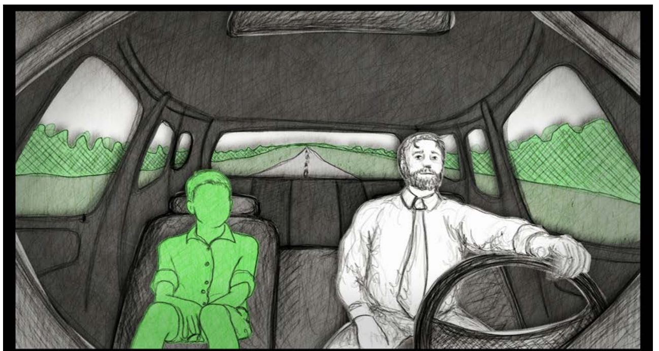
Still image from : “THE TALK” TRUE STORIES ABOUT THE BIRDS & THE BEES